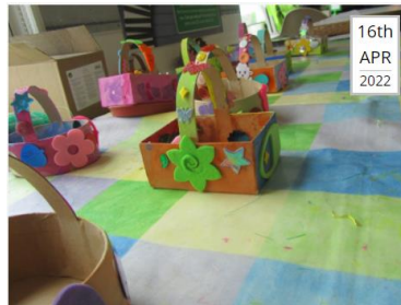
Easter Basket Making Session

https://masandpas.com/easter-egg-hunt-clues-free-printables/