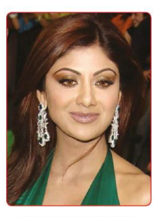
SHOW RACISM THE RED CARD SHOW Who is the most dangerous? Why? I don't think any of them are dangerous. How did you make your decision? Both don't seem to be very dangerous, but they could be.