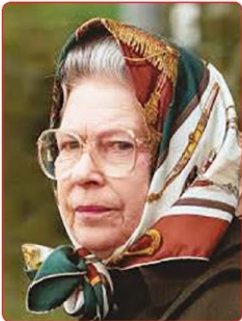
SHOW RACISM THE RED CARD

I made my decision because David Beckham I know him more and he is never racist.