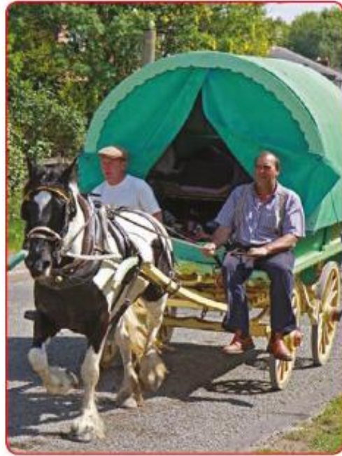
SHOW RACISM THE RED CARD

Who is the most dangerous? Why? I think both of them are dangerous because the picture on the right side has a caravan and in the caravan there might be an innocent person and the people that are riding might have been racist to the person inside .