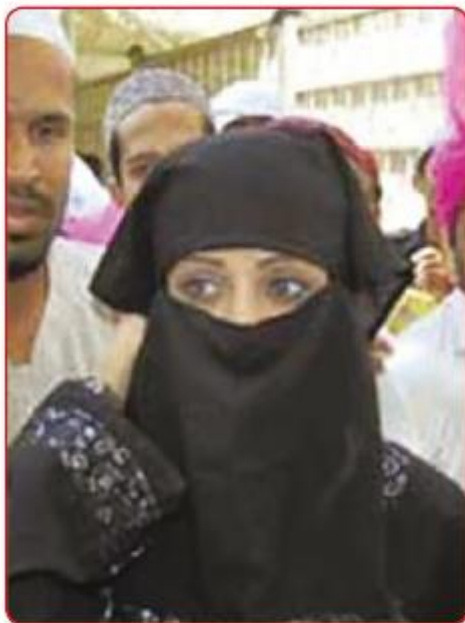
SHOW RACISM THE RED CARD

I made my decision by looking at the pictures carefully and realised what might happen in the picture.