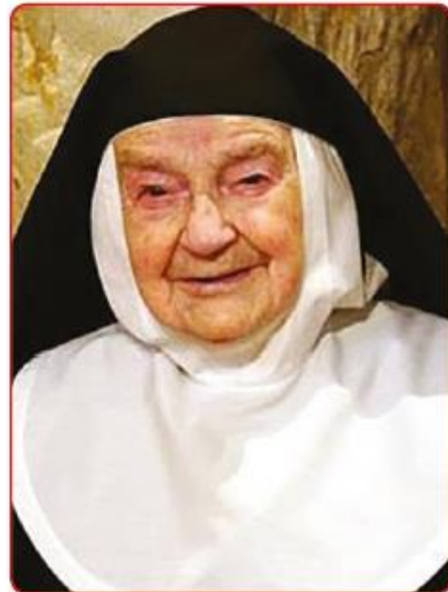
SHOW RACISM THE RED CARD