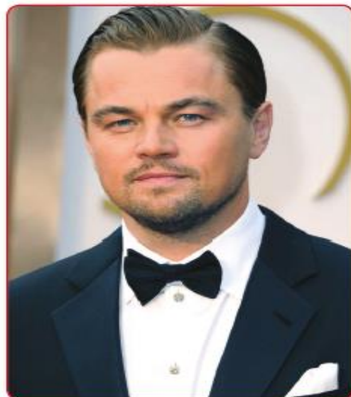
SHOW RACISM THE RED CARD