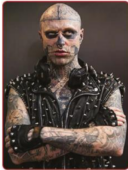
SHOW RACISM THE RED CARD