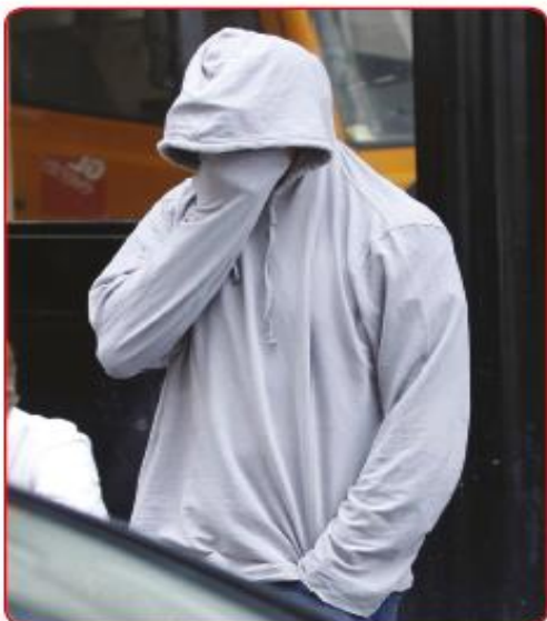
SHOW RACISM THE RED CARD

Look at these images below and decide which one is the most dangerous and why.