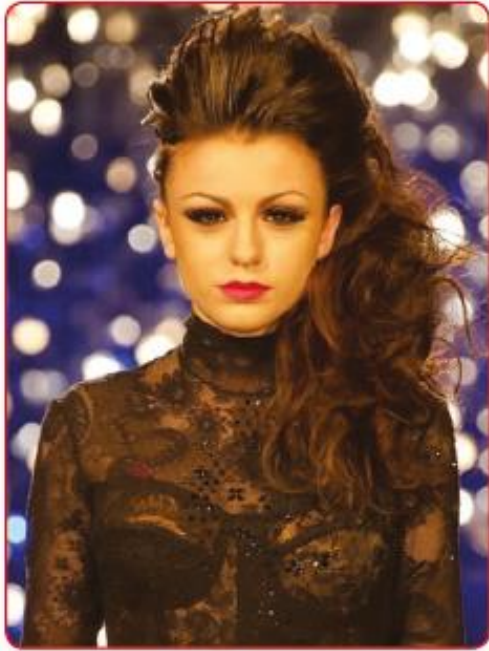
SHOW RACISM THE RED CARD