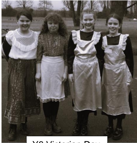
Y6 Victorian Day

Our term begun with the fantastic news that Stamshaw Junior School is a 'good' school as judged by Ofsted. I feel that the opening statement " pupils are flourishing both academically and pastorally because of the school's high expectations " does sum up our school. We do our best to make learning memorable at SJS and I am so grateful to you all for continued support of our great little school. I say little however since I started here at SJS nearly 5 years ago, we have 100 more pupils so we are certainly growing! We are almost at 300.